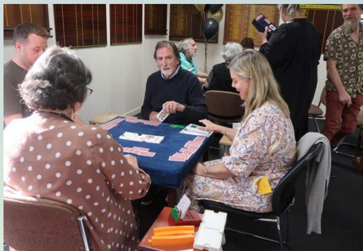
The afternoon Bridge session (full house of 22 tables)