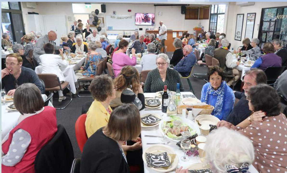
Our 50th Birthday dinner about to start